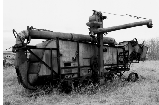
Example of a threshing machine

Around 1918, Frank acquired property four miles south of Crossfield which was used for a successful hay sale business. The purchase of a threshing machine permitted even more business opportunities.