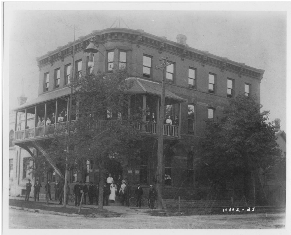
Arlington Hotel, Sarnia, Ontario.