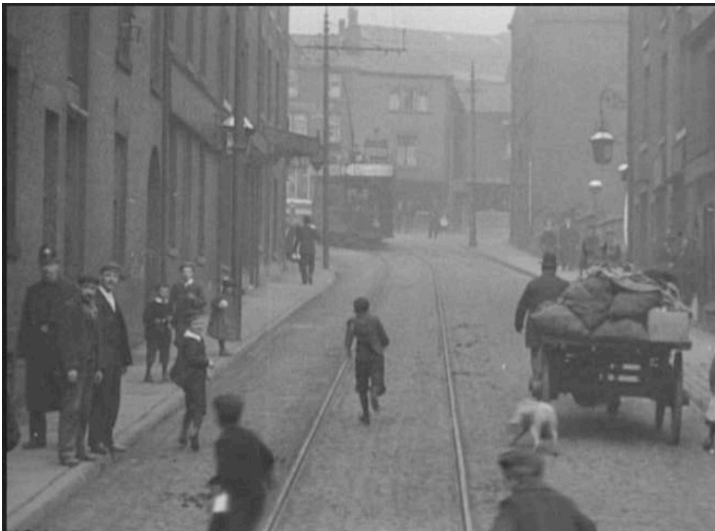
St. Helen's at the beginning of the 20 th Century